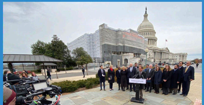
Rep. Chris Stewart (R-UT) introduced Fairness for All legislation December 6, 2019. For four years, CPJ has been part of a broad coalition of religious freedom advocates and LGBT civil rights groups to develop a lasting solution so neighbors with deep differences can live side-by-side.

FOR THE PAST four years, CPJ has helped lead a broad coalition of faith-based, secular and LGBT organizations to explore legislative solutions to the consistent challenges faced by people and organizations of faith and LGBT citizens. One result of CPJ's leadership has been Fairness for All, federal legislation introduced into the U.S. House of Representatives in December 2019. When enacted, Fairness for All will protect the religious freedom of faith-based organizations, and all Americans. To learn more about this effort, visit www.FairnessForAll.org .