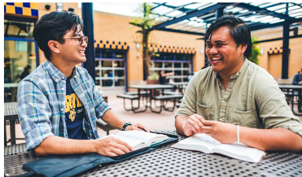
The Navigators Ministry operates on 187 capmpuses, and has been helped by CPRF meetings to discuss changes to federal regulations impacting faith-based organizations operating on secular university campuses.