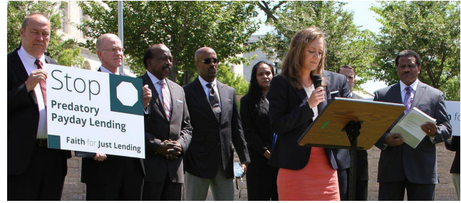
CPJ and the Cooperative Baptist Fellowship are members of Faith for Just Lending, a coalition dedicated to ending predatory lending.

Evangelicals, the Texas Baptists, the National Hispanic Christian Leadership Conference, and more.