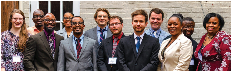
Sacred Sector Fellowship 2018 cohort