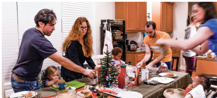
A Political Discipleship group in Washington, D.C. prepares a meal together before discussing the curriculum.